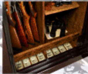
Concealed Floor Compartment