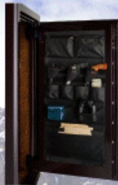
Utility Door Organizer

5/16" BODY 1 1/2" MULTI-STEP DOOR 125 MINUTE FIRE PROTECTION UP TO 1 1/4" DIA. PRY BOLTS 2 3/4" FIREWALL